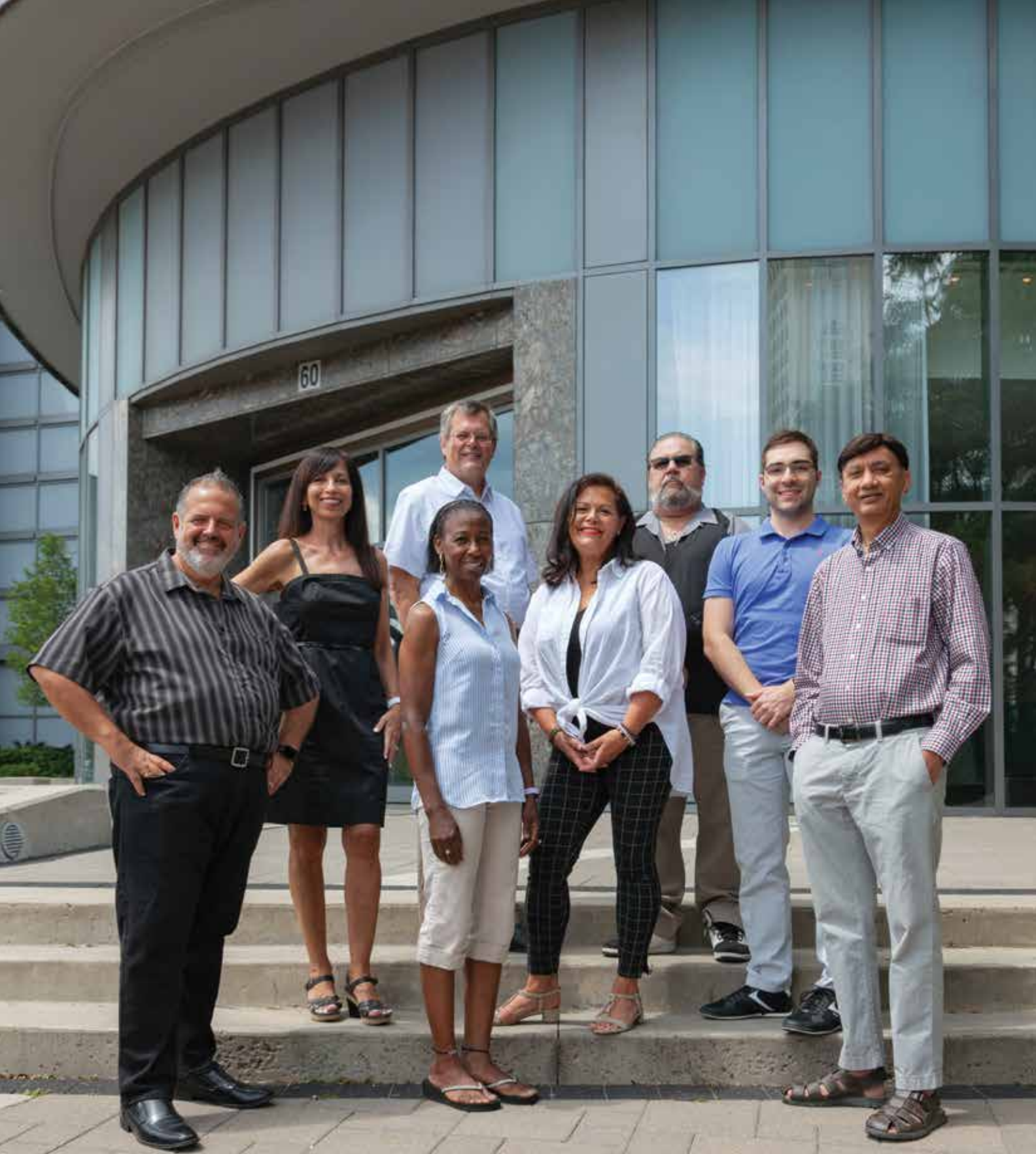
ABSOLUTE'S INNOVATIVE AND HUGELY SUCCESSFUL BOARD ADVISORY COMMITTEE